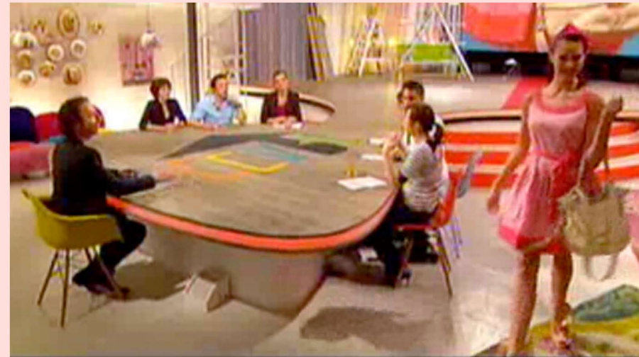
TV show Comment ça va bien on France 2 June 2010