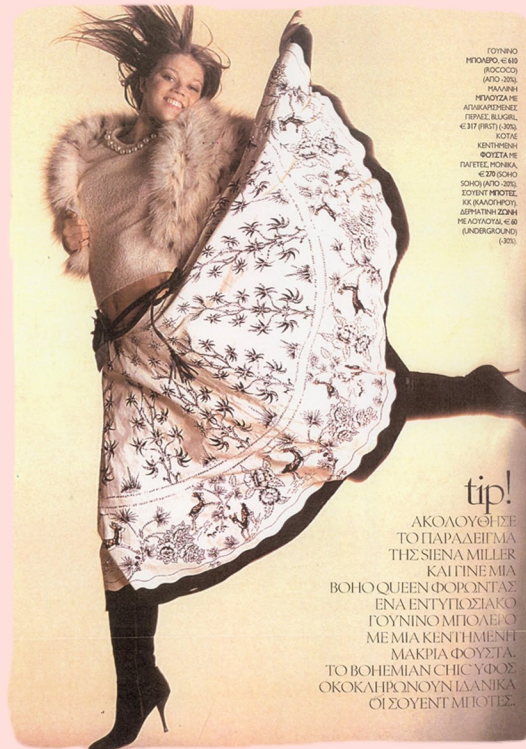
Bambi skirt MIRROR