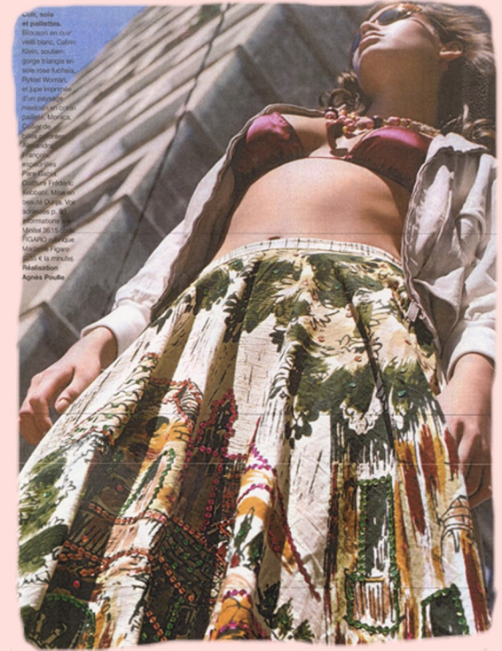
Mexico skirt MADAME FIGARO