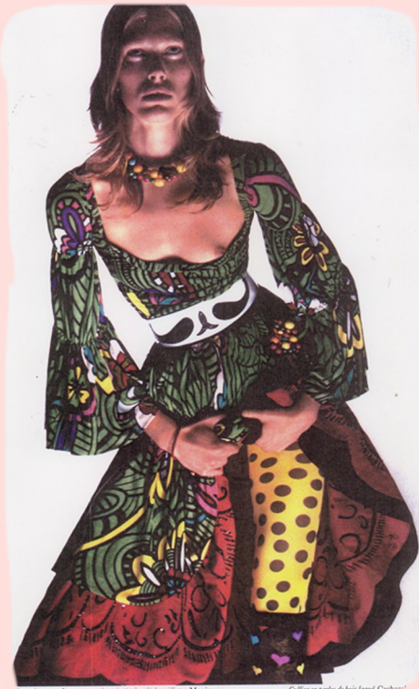
New Delhi skirt VOGUE